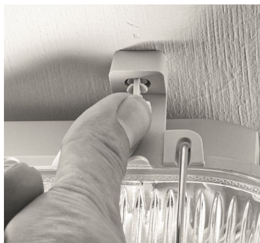
With the DSN 30 you will successfully fasten fire detectors, lamps and sockets at the push of a thumb.